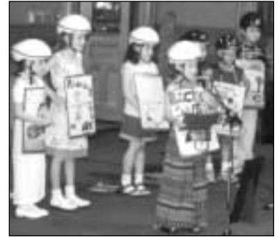
Children from Laurel Ledge School in Beacon Falls, Conn., learned the importance of bike helmets, thanks to a program sponsored by the Connecticut Trial Lawyers Association.

Heartfelt thanks to the Connecticut Trial Lawyers Association for its ongoing support of this wonderful program. ■