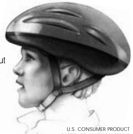
U.S. CONSUMER PRODUCT SAFETY COMMISSION (CPSC)

Connecticut SAFE KIDS Coalition Connecticut Children's Medical Center 282 Washington Street Hartford, Connecticut 06106 (860) 545-9988 TEL • (860) 545-9975 FAX www.ctsafekids.org